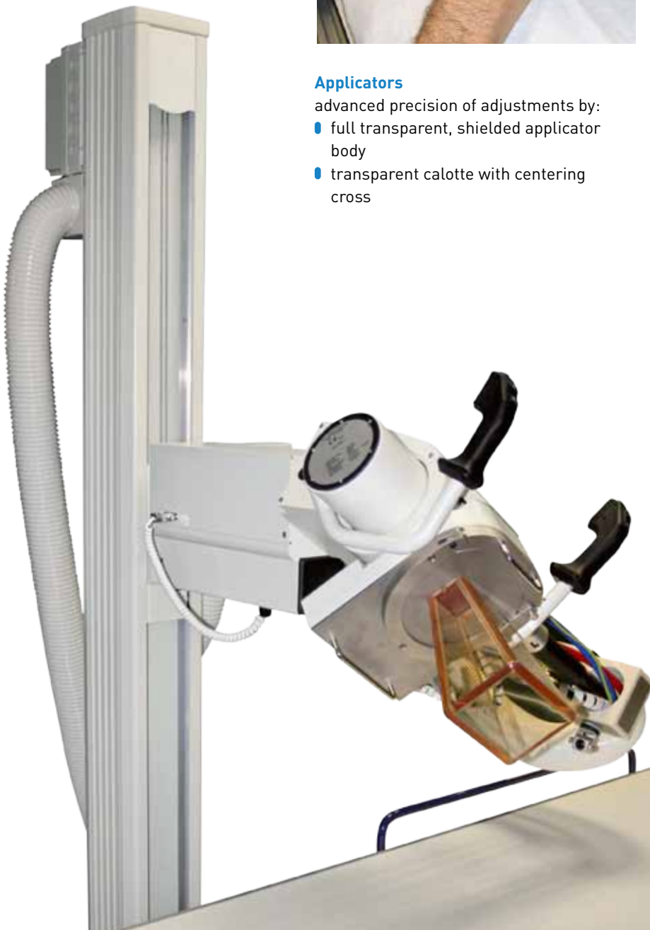
« T-200 column stand

All applicators are distinctive coded and could be assigned unique to one or more half-value-layers. The applicators are available in focal-skin-distances of 20, 30, 40 and 50 cm with circular or rectangular shapes.