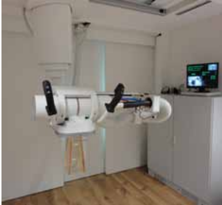
T-200 with >> ceiling suspension

covers the whole range of conventional x-ray therapy – can be used for superficial and orthovoltage treatments.